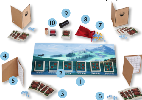
Game setup for 4 players